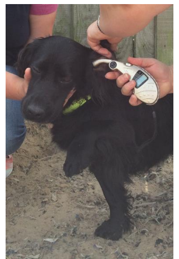
Figure 4. A VetTemp® tympanic membrane thermometer