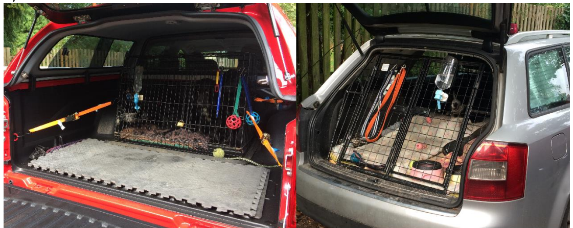
Figure 2. Dogs housed in cars with examples of appropriate modifications to prevent overheating: light coloured cars, parked in full shade, reflective sun shade and tinted windows, open windows, boots left open, free access to water, and subject to regular checks by the owner.

This advice also applies to owners leaving dogs in vans, caravans, conservatories and mobile kennels. In situations where this cannot be avoided such as summer dogs shows, competitions and holidays, appropriate action should be taken to prevent the dog's environment becoming unsuitably hot. Positioning the vehicle in complete shade, avoiding dark coloured vehicles, using reflective sun shades, fully opening windows or where possible doors to ensure air movement, providing free access to water and above all constantly monitoring the dog's conditions can reduce the risk of overheating (see examples in figure 2).