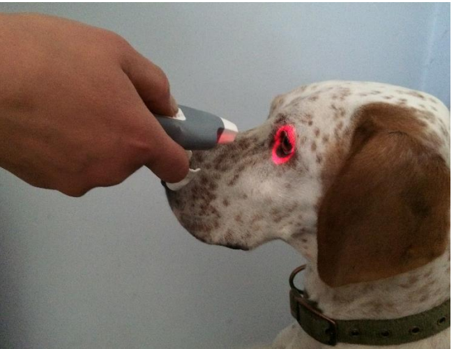
Figure 5. A Thermofocus Animal® non-contact infrared thermometer

To date there are published canine heatstroke case series from USA, Germany and Israel, reporting mortality rates of 36-50% (Drobatz and Macintire, 1996; Bruchim et al., 2006; Teichmass et al., 2014; Segev et al., 2015). Typical presenting clinical signs are presented in Figure 6, and include excessive panting with exaggerated tongue protrusion, tachycardia, collapse, haemorrhagic vomiting and diarrhoea, shock and bleeding disorders (Drobatz and Macintire, 1996; Bruchim et al., 2006). Left untreated, symptoms will develop to convulsions, organ failure and eventually death.