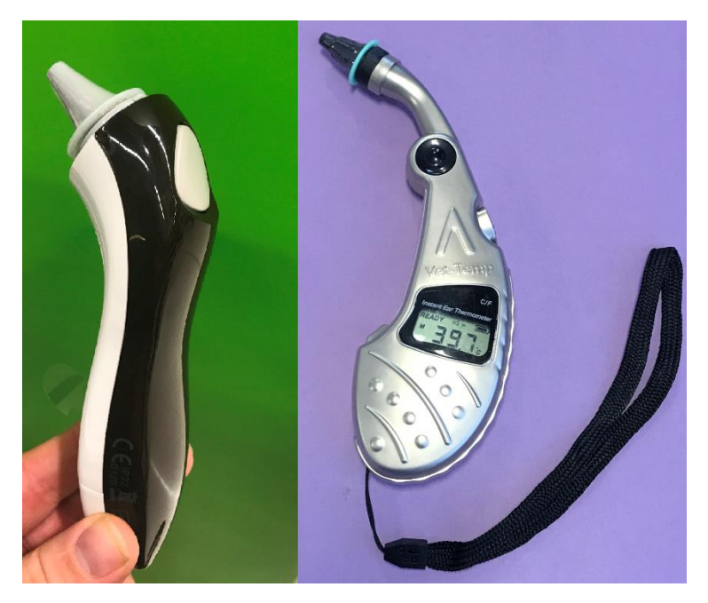
Figure 3. A human aural thermometer alongside a VetTemp<sup>®</sup> aural thermometer with probe cover in place.

As this study measured TMT in a non-veterinary setting, additional work establishing a reference range in veterinary patients would be beneficial. The stress of visiting a veterinary practice can elevate body temperature, establishing how this affects the upper end of the reference range could aid veterinary professionals in interpretation of the temperature measurements.