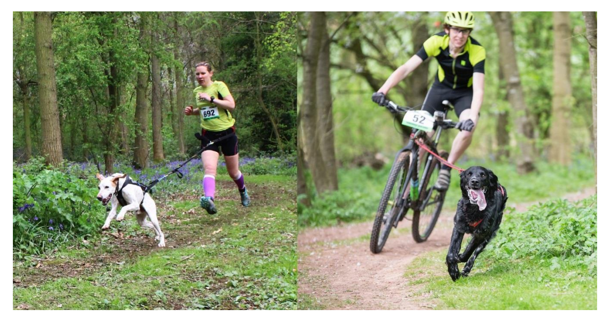
Figure 1: One dog canicross competitor on the left, one dog bikejor competitor on the right.

The sport canicross involves competitors completing a cross country style race either running, cycling or scootering, whilst harnessed to dogs (see figure 1). The dogs normally run ahead, taking up the slack in the bungee line and providing some assistance to the runner. Canicross is an effective means of exercising both runner and dog over relatively short 'sprint' distances of approximately 5km (although longer competitive distances are run). Now formally recognised by The Kennel Club, the sport has been run competitively in the UK since 2000, with increasing numbers of competitors taking part in races around the country (The Kennel Club, 2017). As race results are ultimately linked to both human and dog speed, the sport can promote increased physical activity, encouraging people to exercise with their dog to improve their race times, competitive performance, health and fitness in both species.